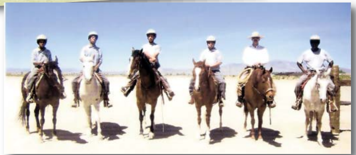
NO HORSEING AROUND Students enjoy an afternoon horseback ride at Silver State Academy.