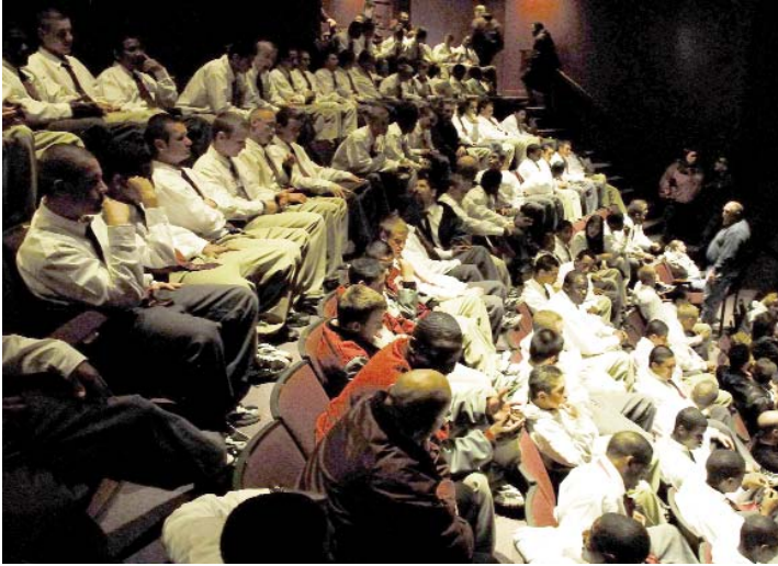
Encore! The Reno Dance Company held an exclusive performance for SSA students to thank them for all of their work supporting the arts in the local community.

The Yerington Theater for the Arts played host to students from Silver State Academy for “Broadway Blast”, a special contemporary dance stage presentation featuring selections from Broadway musicals over the last five decades. The 90-minute live stage presentation had the students’ full attention for the entire show.