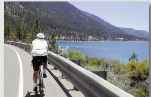
There’s no arguing why it’s called America’s Most Beautiful Bike Ride.

Those ROP students who did not make the strenuous trek around the lake supported the event by manning the largest aid station along the route. (Continued on page 2)