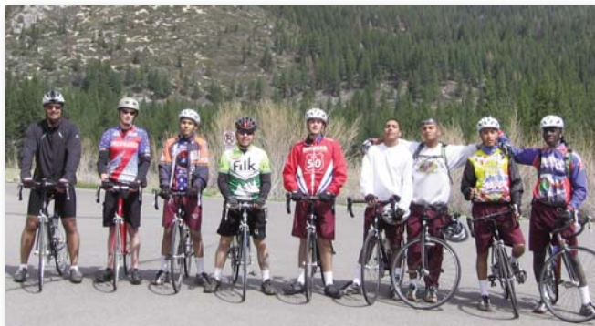
IT'S ALL DOWNHILL FROM HERE The cycling team isn't worried about getting "too-tired" at the next big race.