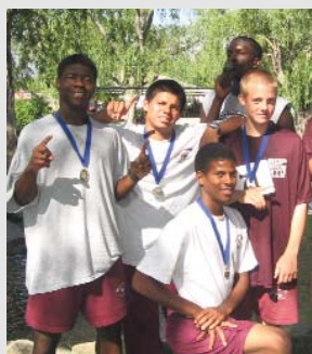
ROP students are always eager to lend a hand – even after a 10k run.