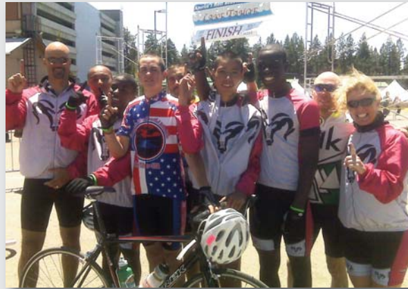
Staff and students celebrate at the finish line.

Ride” (AMBBR). The event, now in its 17th year, is a 72-mile circumnavigation of Lake Tahoe and a fundraiser for the Leukemia and Lymphoma Society. This year’s event raised more than $7.5 million to support the organization’s mission of finding a cure for leukemia, lymphoma, Hodgkin’s disease and myeloma, as well as improving the quality of life for patients and families.