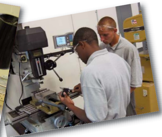
THE TOOLS OF THE TRADE Students are eager to take part in SSA's newest vocational training program--machine tool trades.