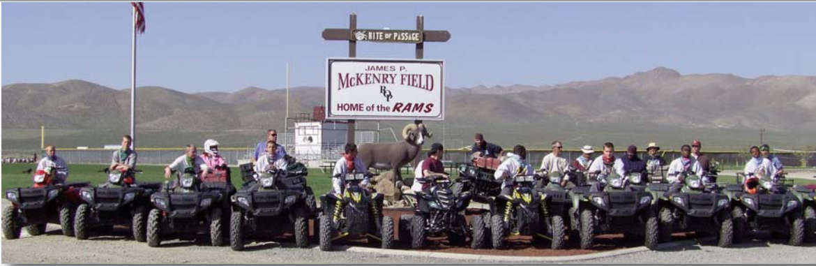
OFF THE BEATEN PATH As part of a RAMS outing to award outstanding student achievement and progress, Silver State sent out 10 Ram students with 10 staff on Quads for a 31 mile trek to Weber Dam. Prior to the outing, students were instructed on safety, responsibility and respect for the environment.