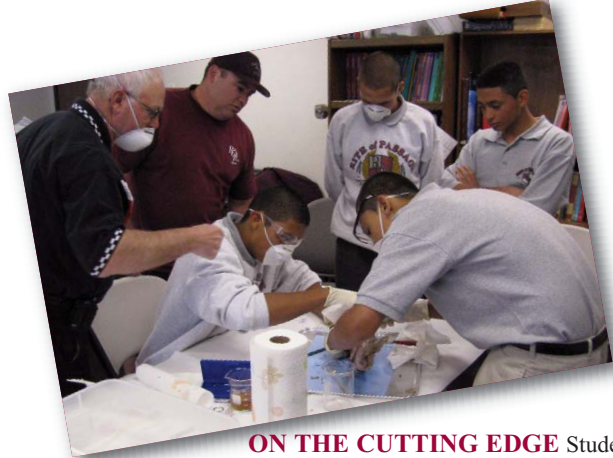
ON THE CUTTING EDGE Students learn about biology first-hand during a dissection lab.