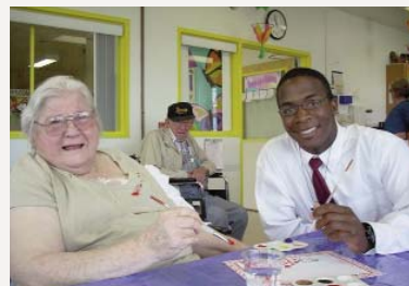
A student helps a resident with an art project.

Students currently have the opportunity to volunteer anywhere from two to three days a week, and a number of RAMS have had the opportunity to participate. The program has already proven to be a great success and the current plan is to continue to work with the residents while expanding the number of students involved.