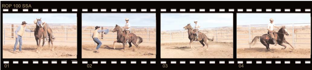
HORSE WHISPERER... Equine-assisted therapy helps both the student and the horse as they learn to trust one another and work together.