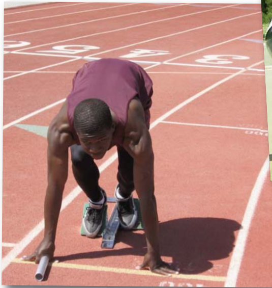
CATCH THEM IF YOU CAN SSA's track and field team had another record-breaking year.