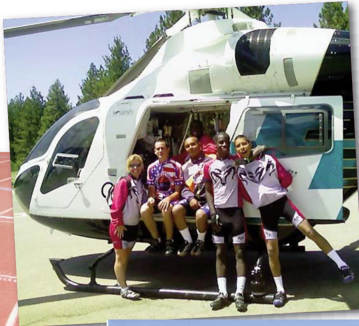
LOOK WHAT DROPPED IN ROP's cycling team was surprised when a helicopter appeared and landed just feet away from where they were having lunch.